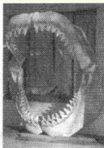
A reproduction of a shark jaw, available at Maxilla & Mandible. Six feet high and retails for $9,500.

Meurice Garment Care, 245 East 57 Street, between Second and Third Avenues, 212-759-9057. Other locations in Greenwich Village and Manhasset, Long Island.